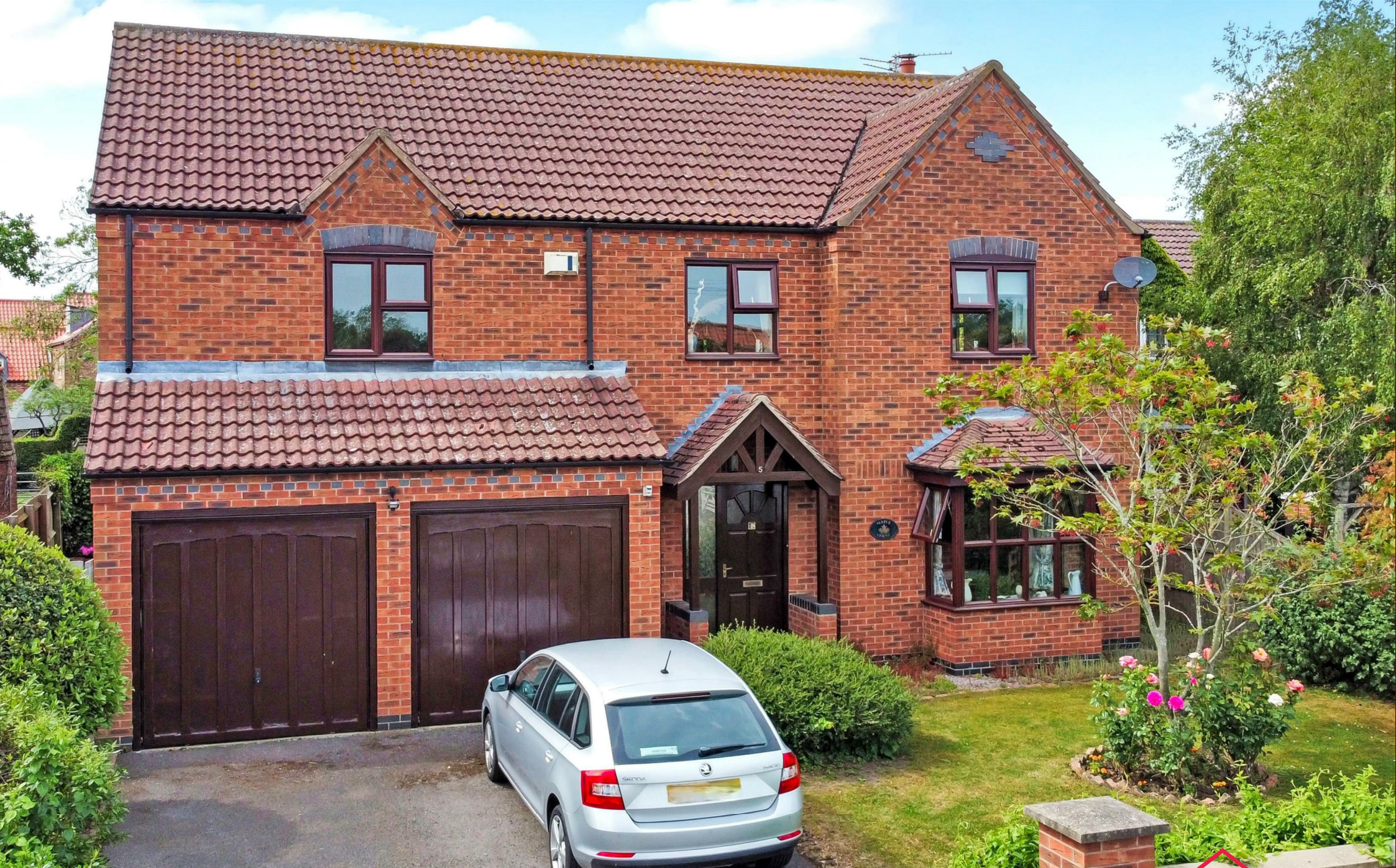
Maple House, School Lane, Claypole, Newark