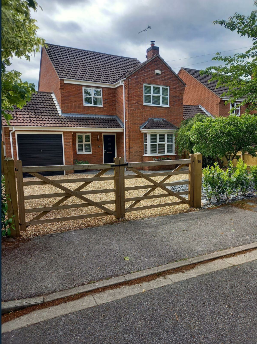
The Paddocks, Newton-on-Trent, Newark