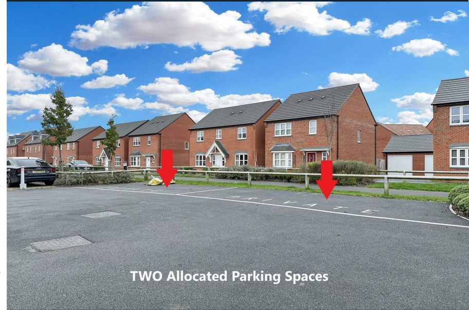
TWO Allocated Parking Spaces

Internal viewings are vital, in order to gain a full sense of appreciation for the CLASS & ABUNDANCE OF QUALITY inside this contemporary cracker! We're certain you won't leave disappointed!!!