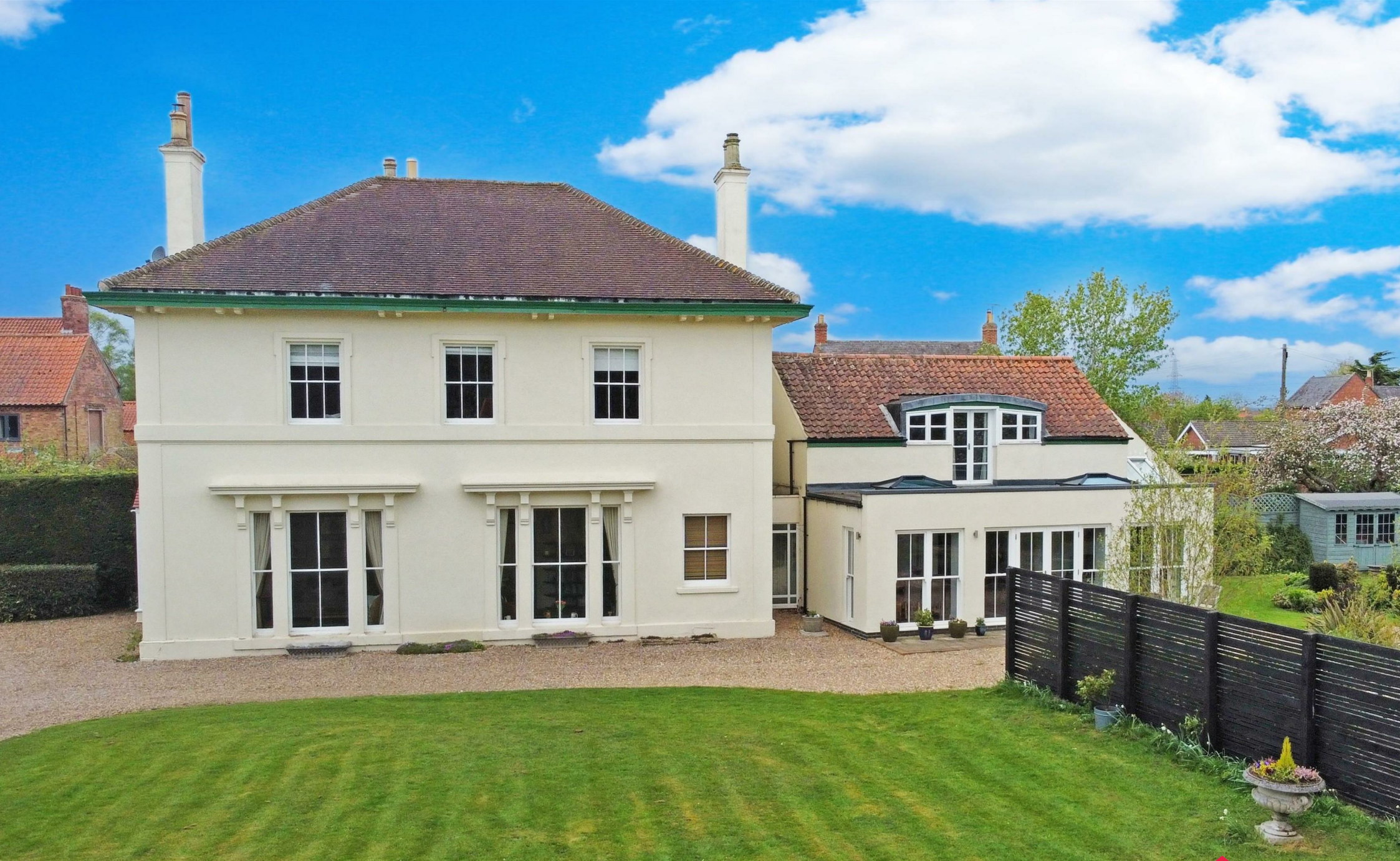
Mayfield House, High Street, Collingham, Newark