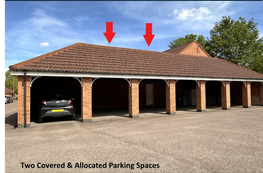
Two Covered & Allocated Parking Spaces