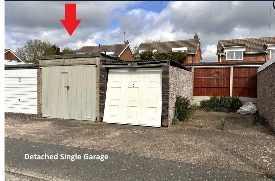
Detached Single Garage