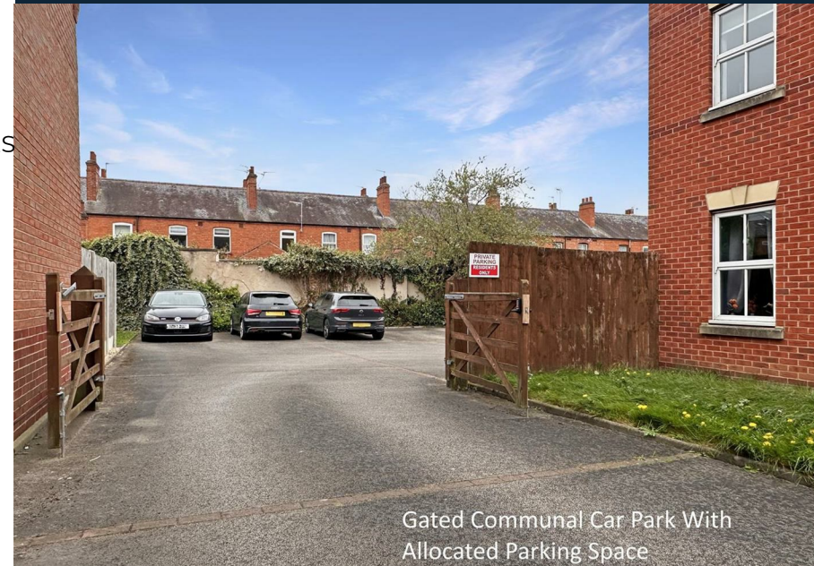
Gated Communal Car Park With Allocated Parking Space

With CONVENIENCE ON YOUR DOORSTEP... It's time to turn the key and begin your next chapter. Marketed with NO ONWARD CHAIN!