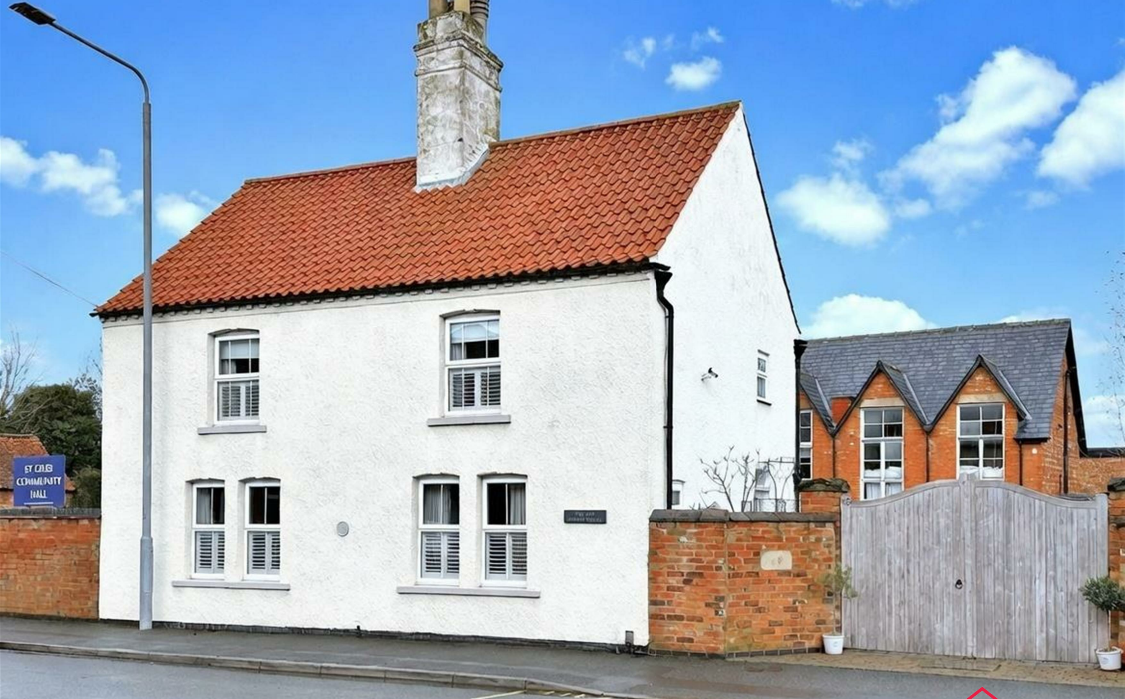
The Old School House, Main Street, Balderton, Newark