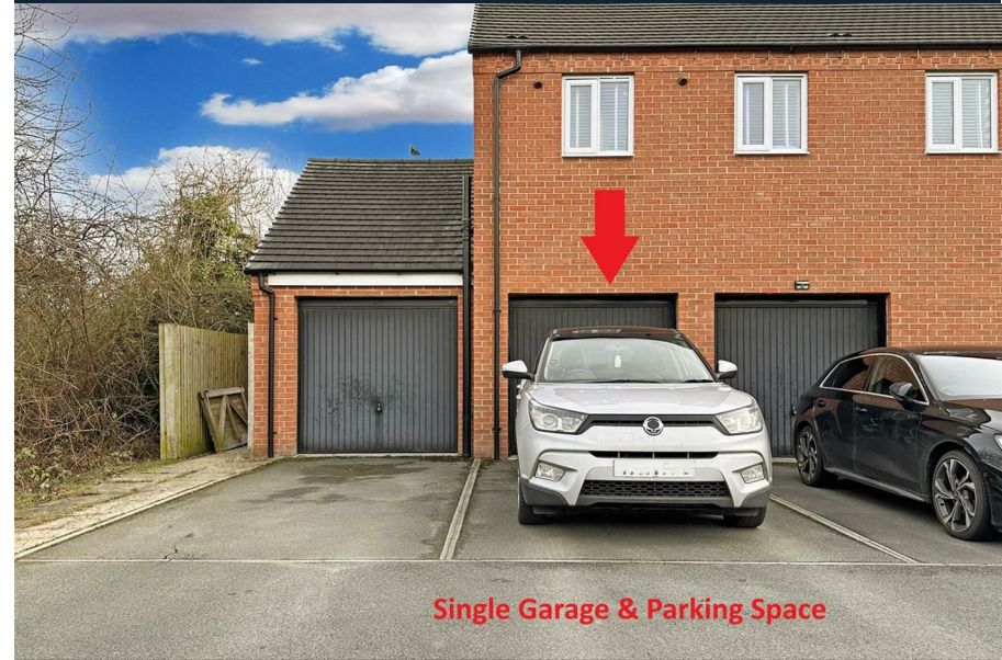
Single Garage & Parking Space