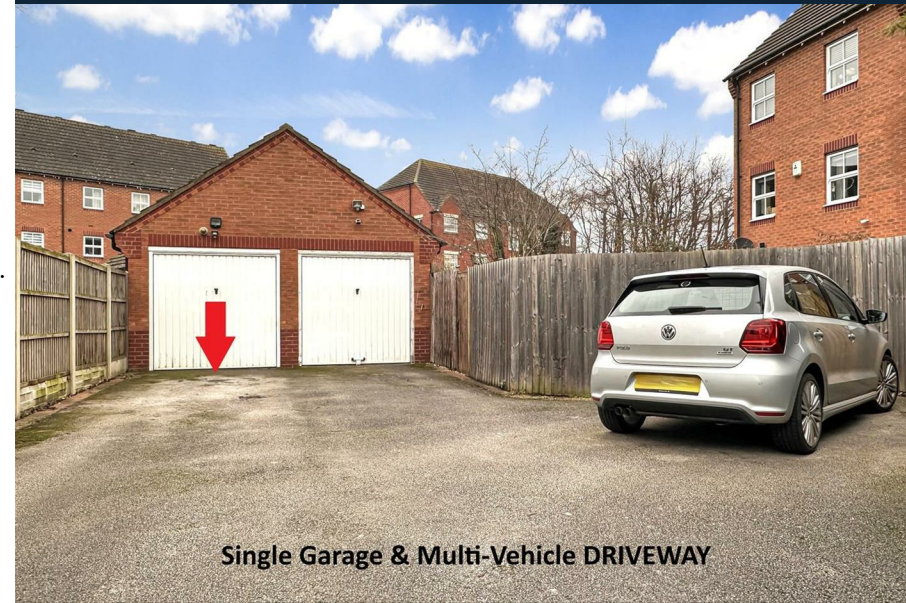
Single Garage & Multi-Vehicle DRIVEWAY