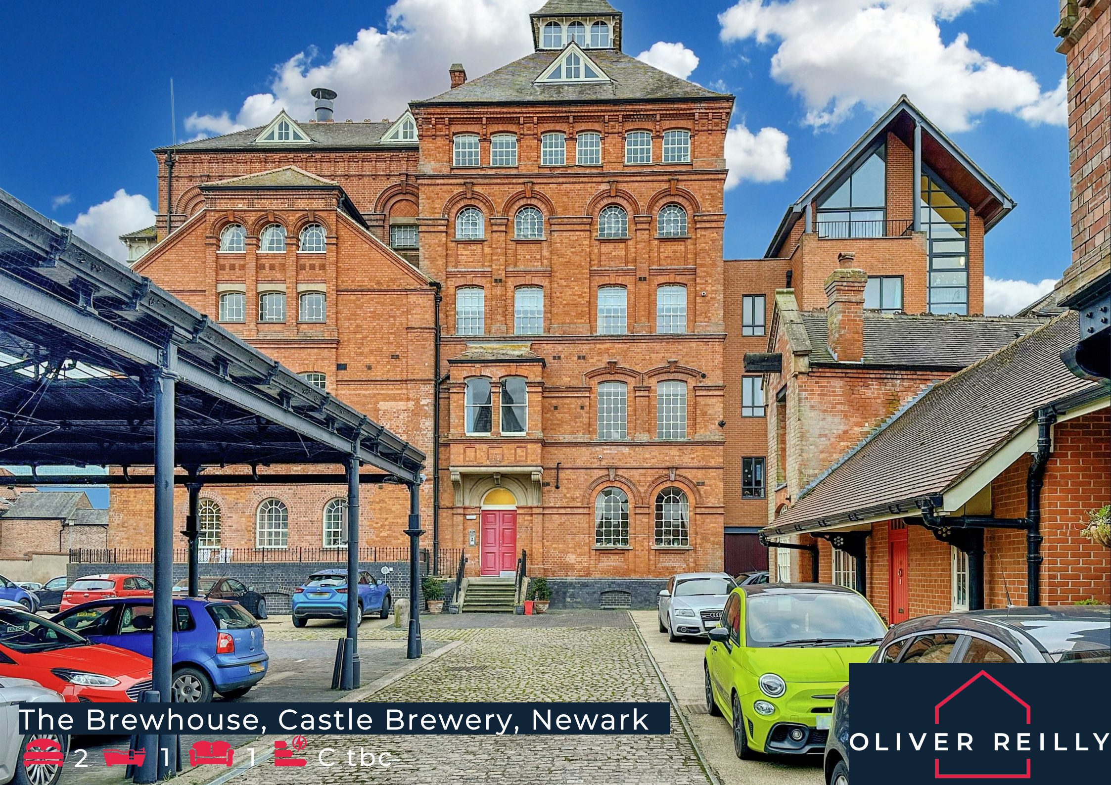
The Brouse, Castle Brewery, Newark