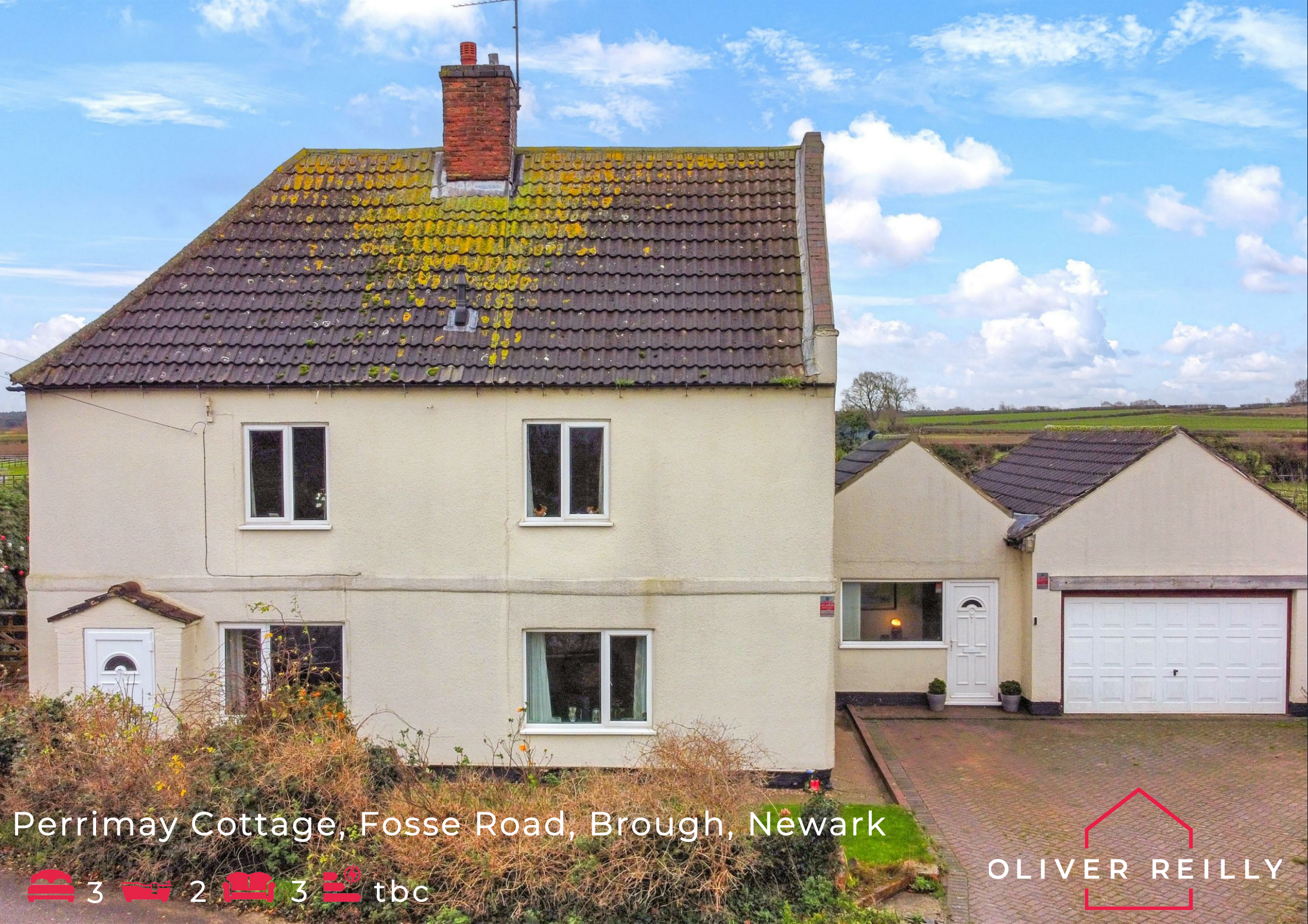
Perrimay Cottage, Fosse Road, Brough, Newark