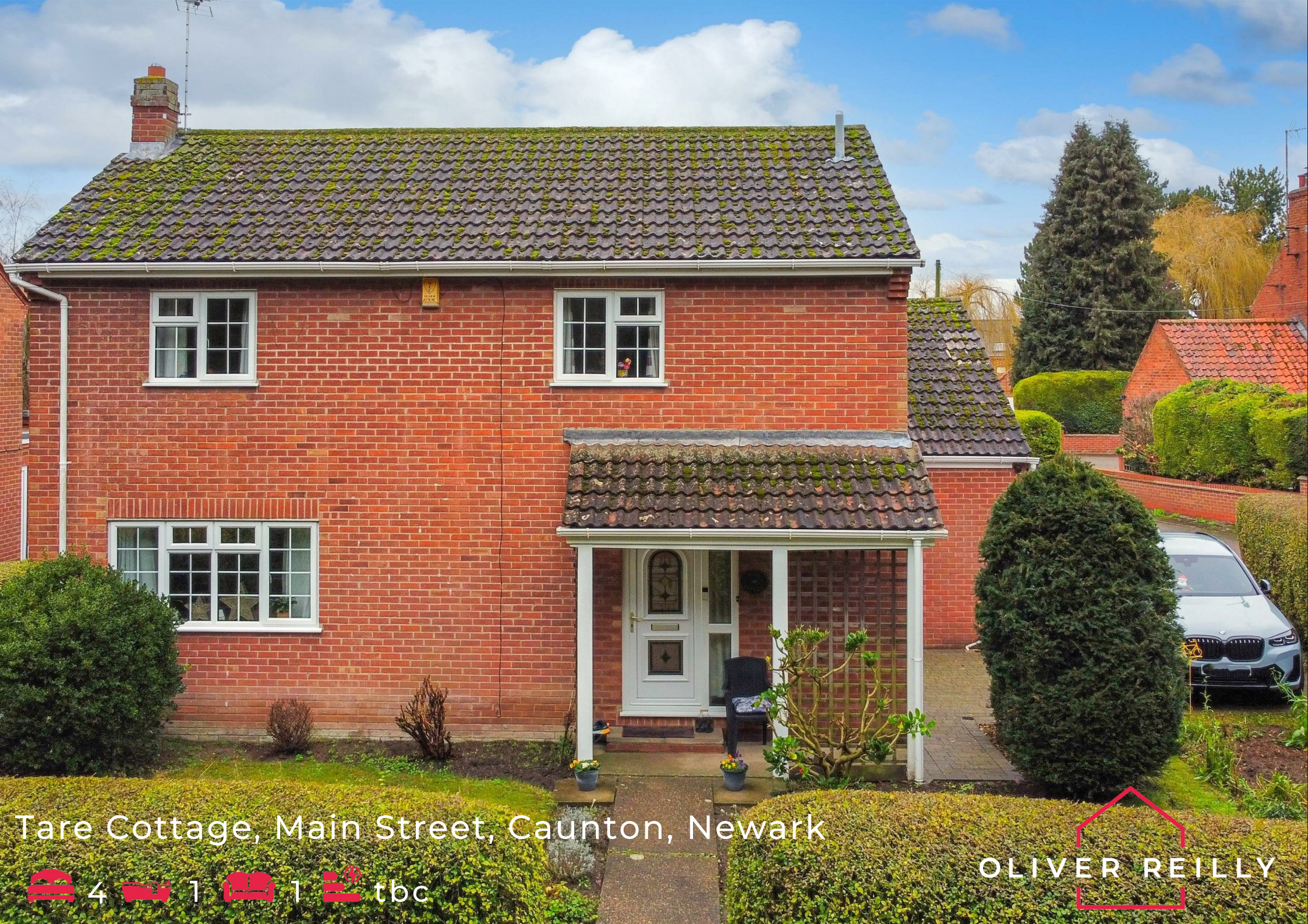
Tare Cottage, Main Street, Caunton, Newark