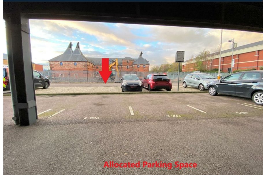
Allocated Parking Space