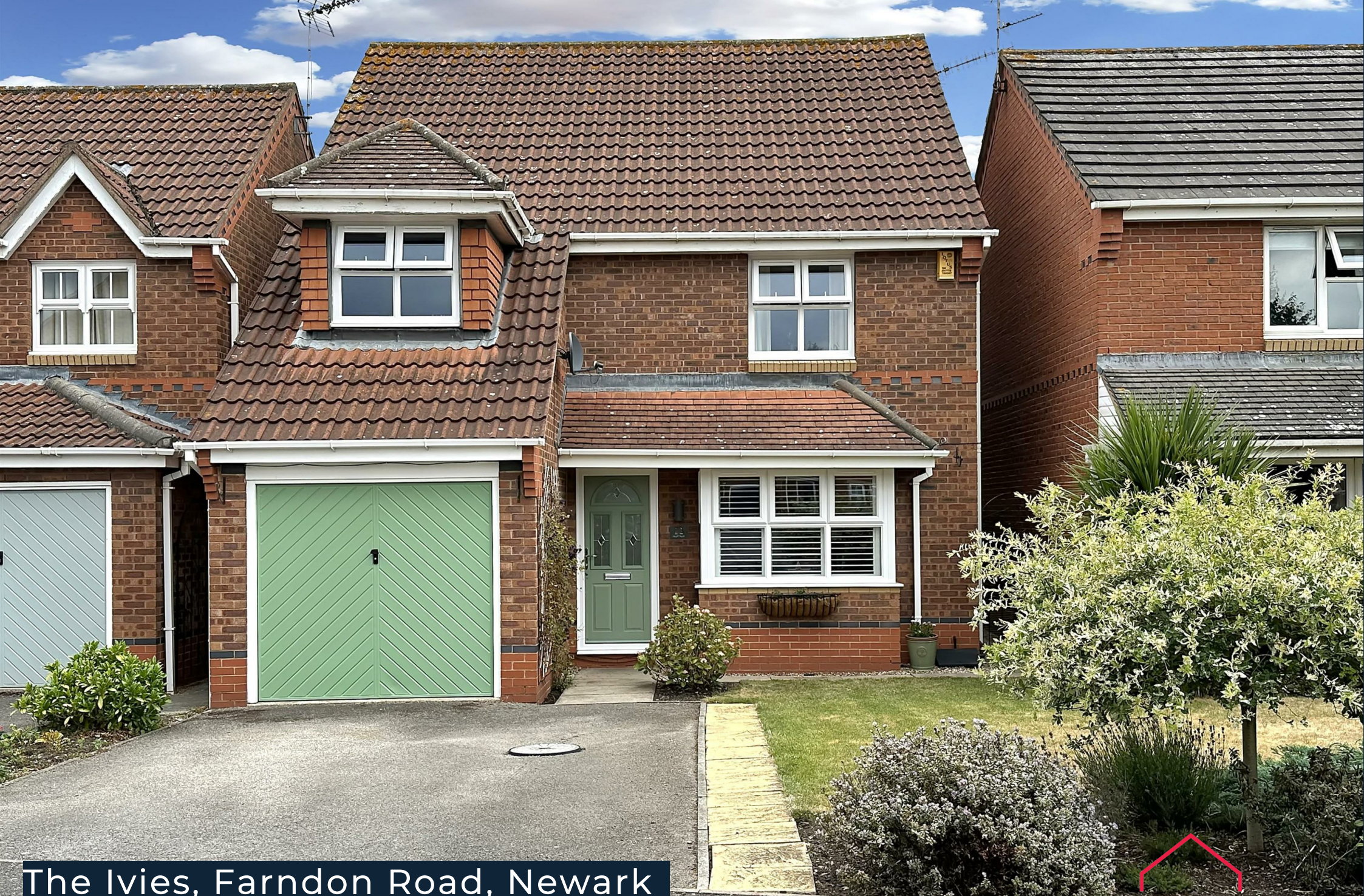
The Ivies, Farndon Road, Newark