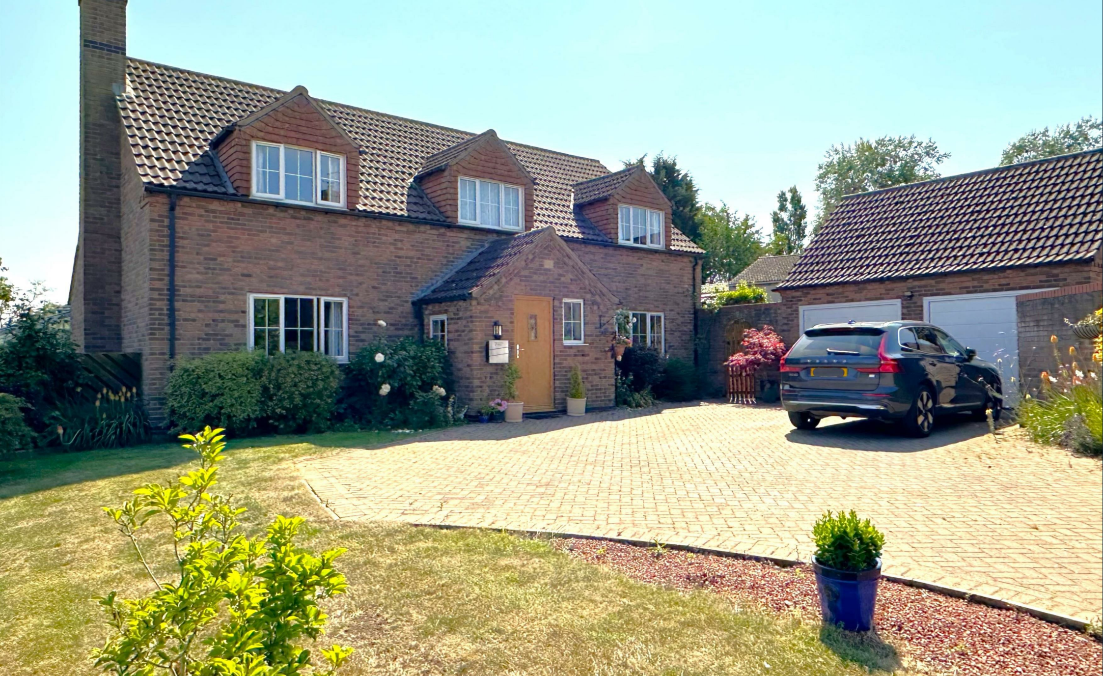
Woodlake Cottage, High Meadow, Dry Doddington