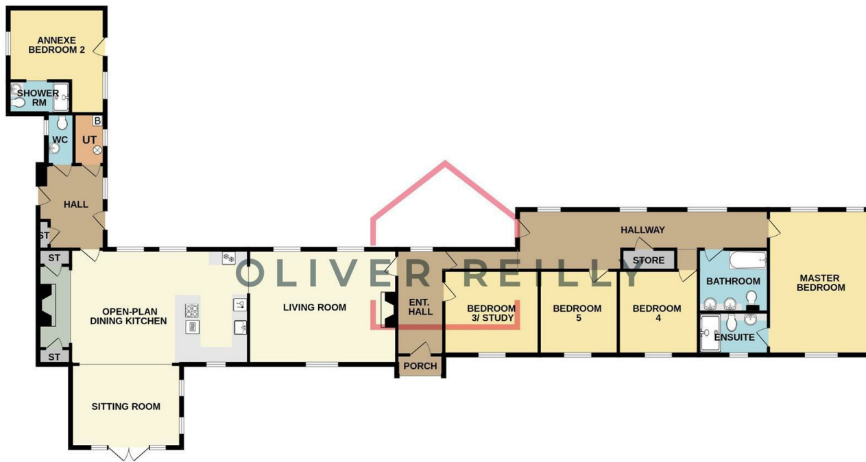
GROUND FLOOR 634 sq.ft. (58.9 sq.m.) approx.