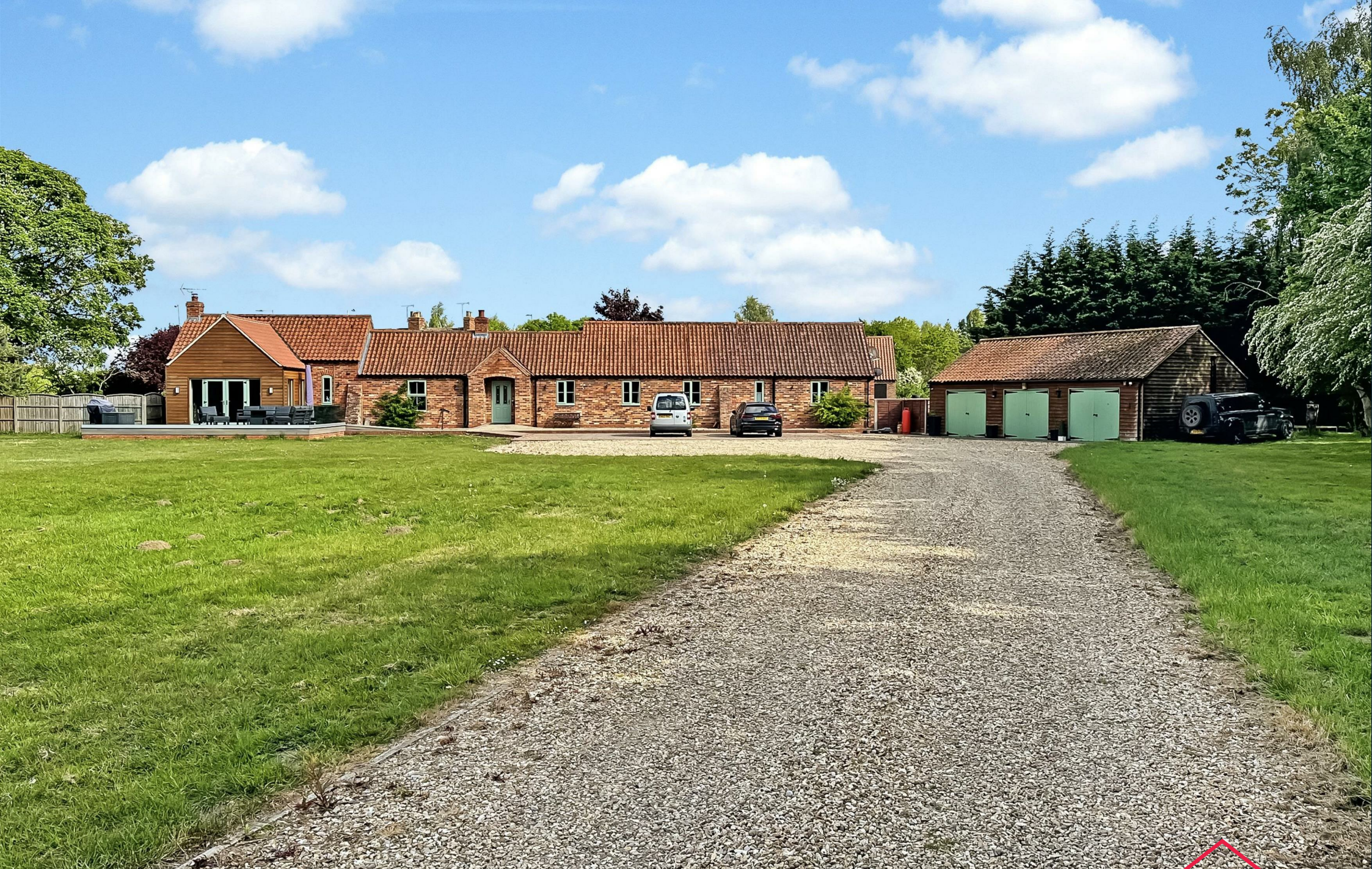
Halfway Farm Cottage, Newark Road, Swinderby, Lincoln