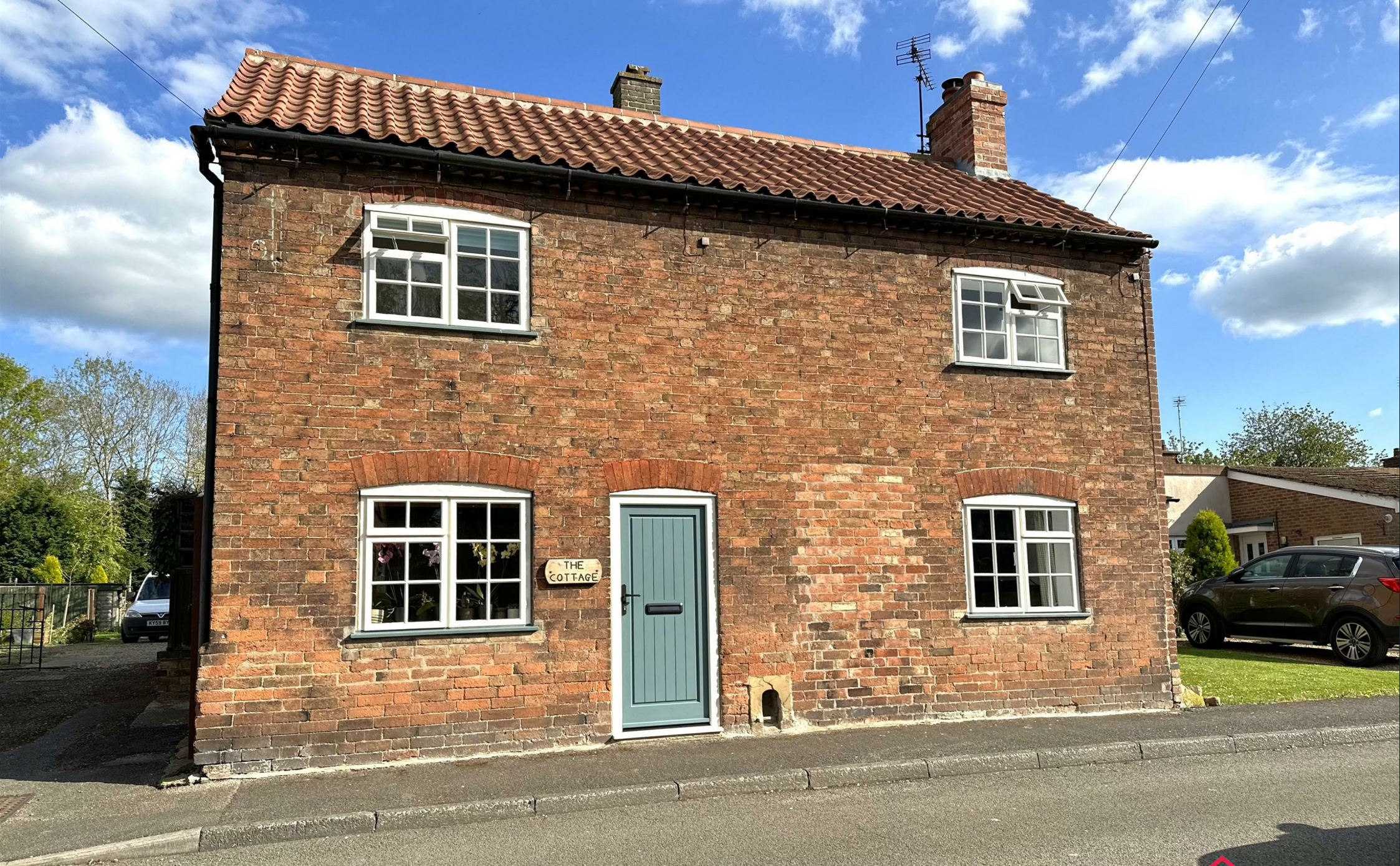
The Cottage, Chapel Street, Orston, Nottingham