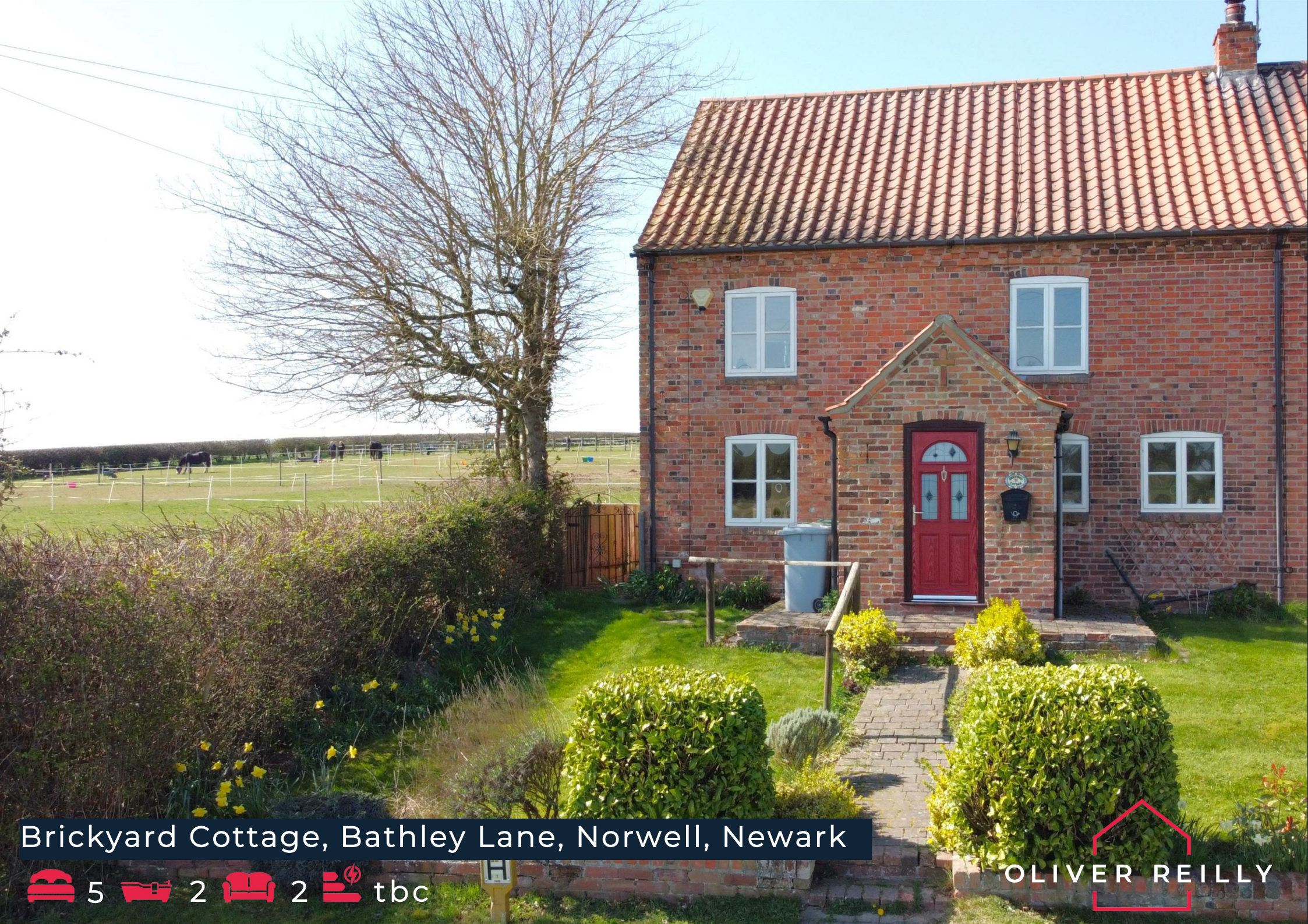
Brickyard Cottage, Bathley Lane, Norwell, Newark