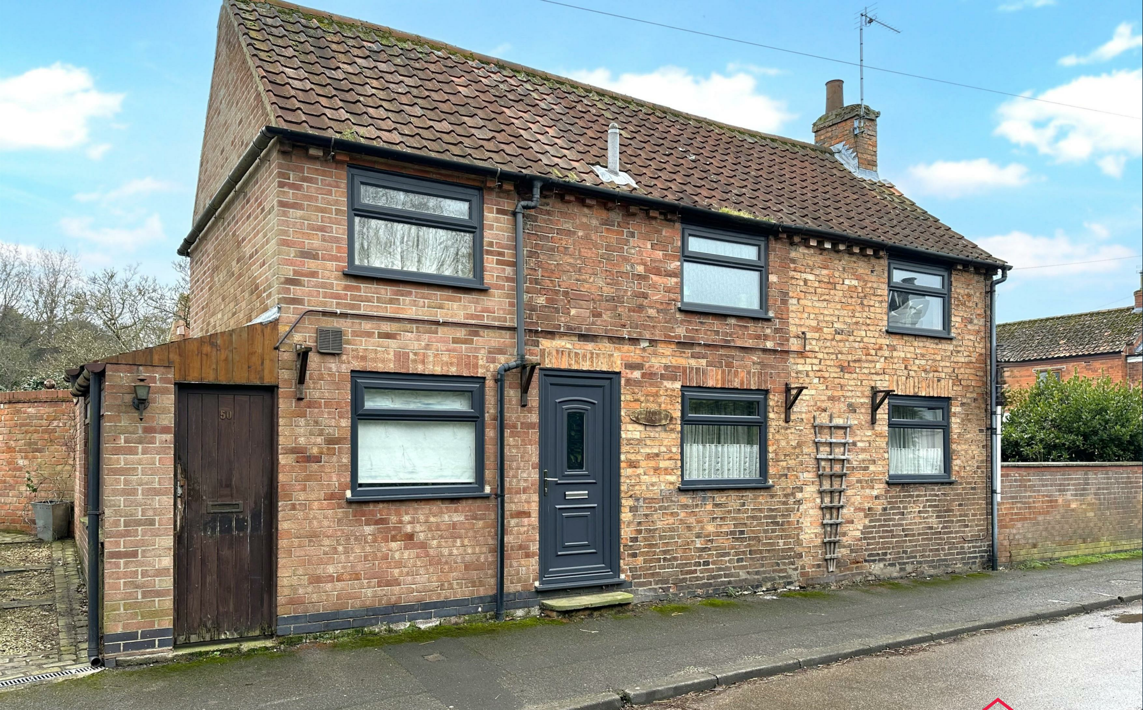
Glen Cottage, Low Street, Collingham, Newark