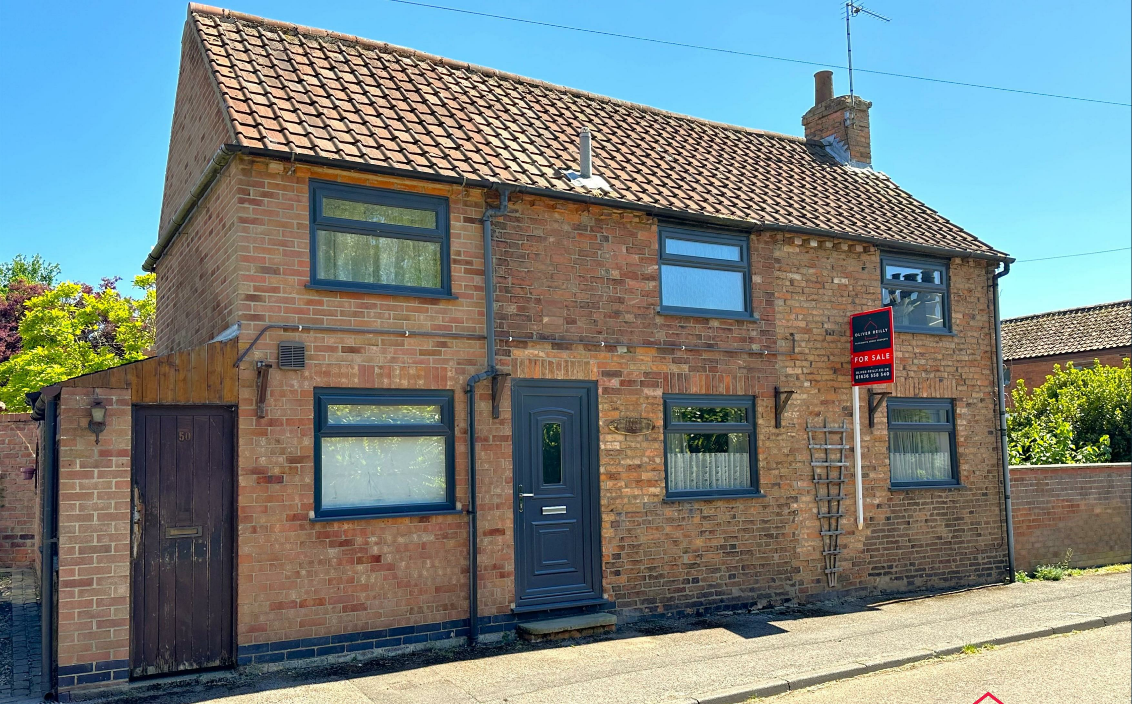
Glen Cottage, Low Street, Collingham, Newark