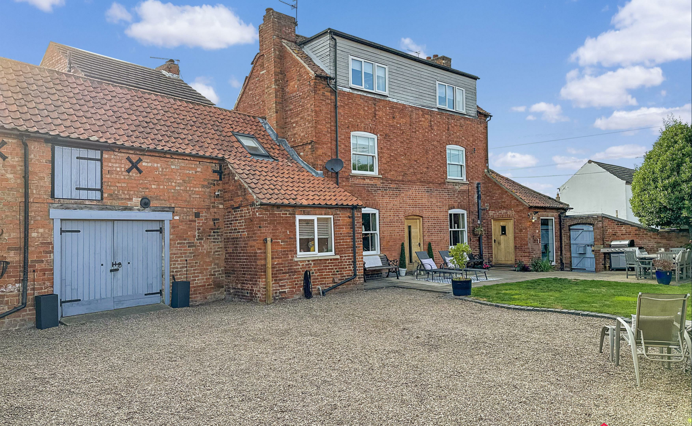
Laburnham House, Main Street, Balderton, Newark