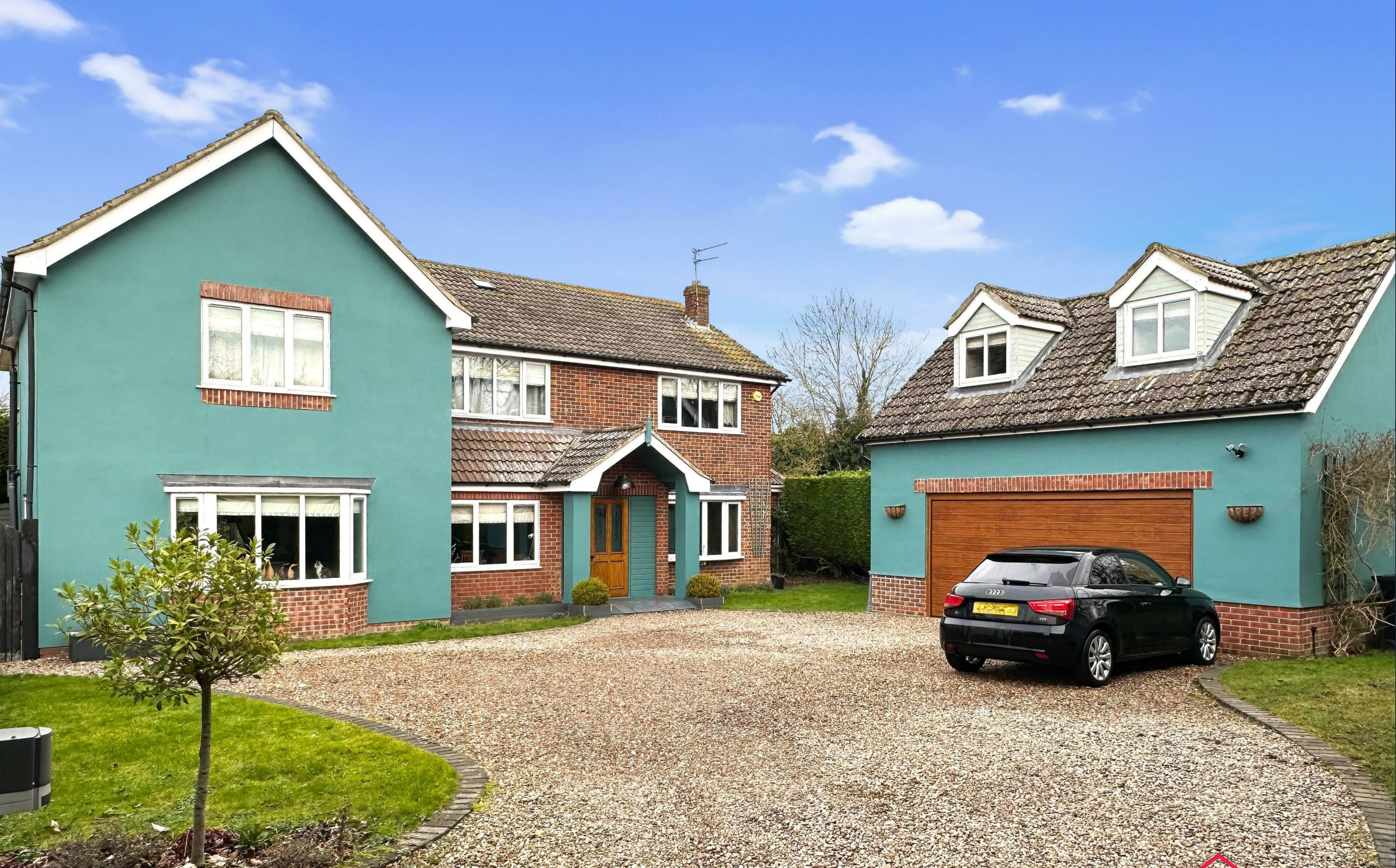
Maple House, Costa Row, Long Bennington, Newark