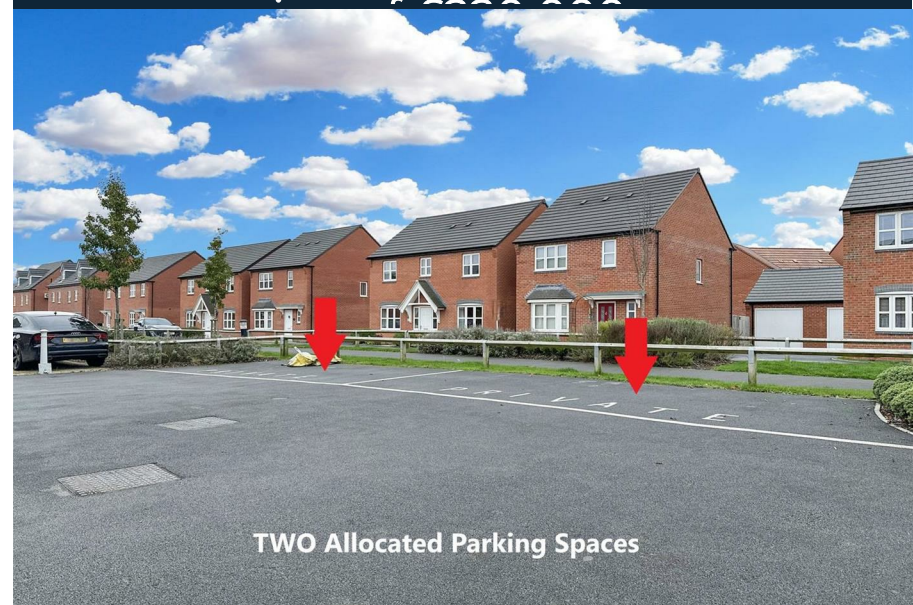
TWO Allocated Parking Spaces