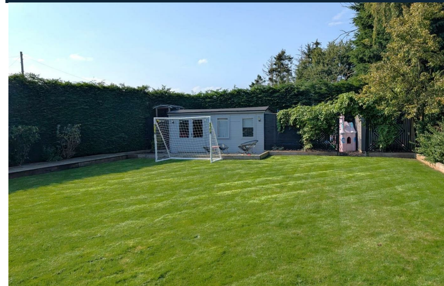
RECEPTION HALL: 19'1 x 15'8 (5.82m x 4.78m)

Accessed via a secure composite front entrance door accompanied by an obscure uPVC double glazed floor to ceiling window. Providing complementary oak engineered flooring, a walk-in feature bay window to the front elevation, with uPVC double glazed windows. A lovely oak staircase with glass balustrade, two stylish vertical radiators, recessed ceiling spotlights, telephone point, alarm control panel, PIR alarm sensor, central heating thermostat. Access into both reception rooms and through to the inner hall. Max measurements provided into bay-window.