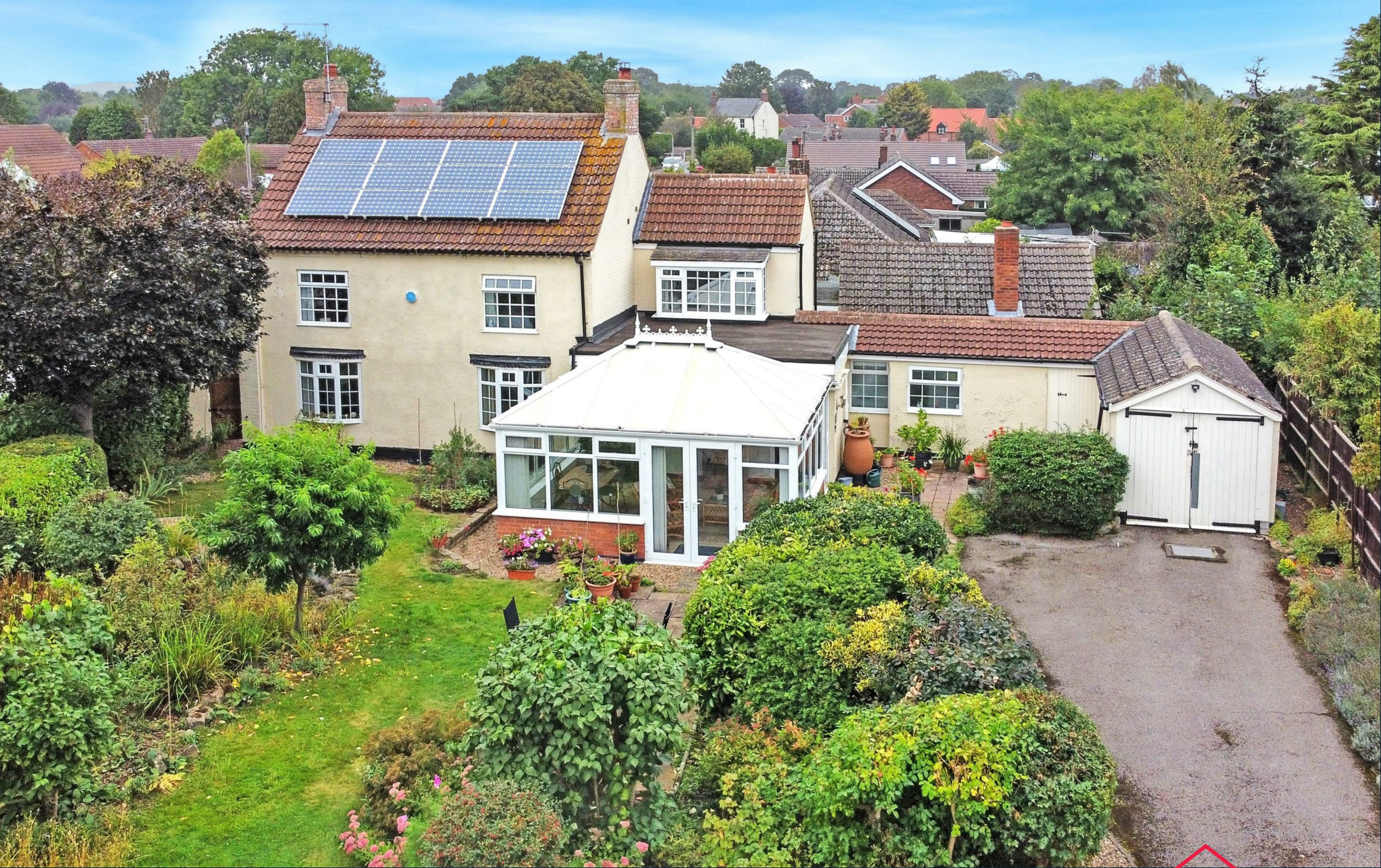
Ferry Lane, Cottage, Main Street, North Muskham