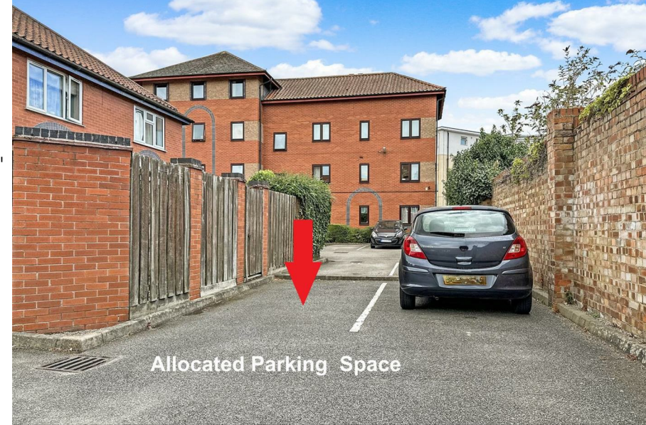
Allocated Parking Space

Externally, the apartment provides an allocated parking space for convenience. Further benefits of this lovely modern home include uPVC double glazing, a secure telecom entry system and electric heating. LIVE THE LIFESTYLE... In this primely positioned home. Step inside and gain a full sense of appreciation!