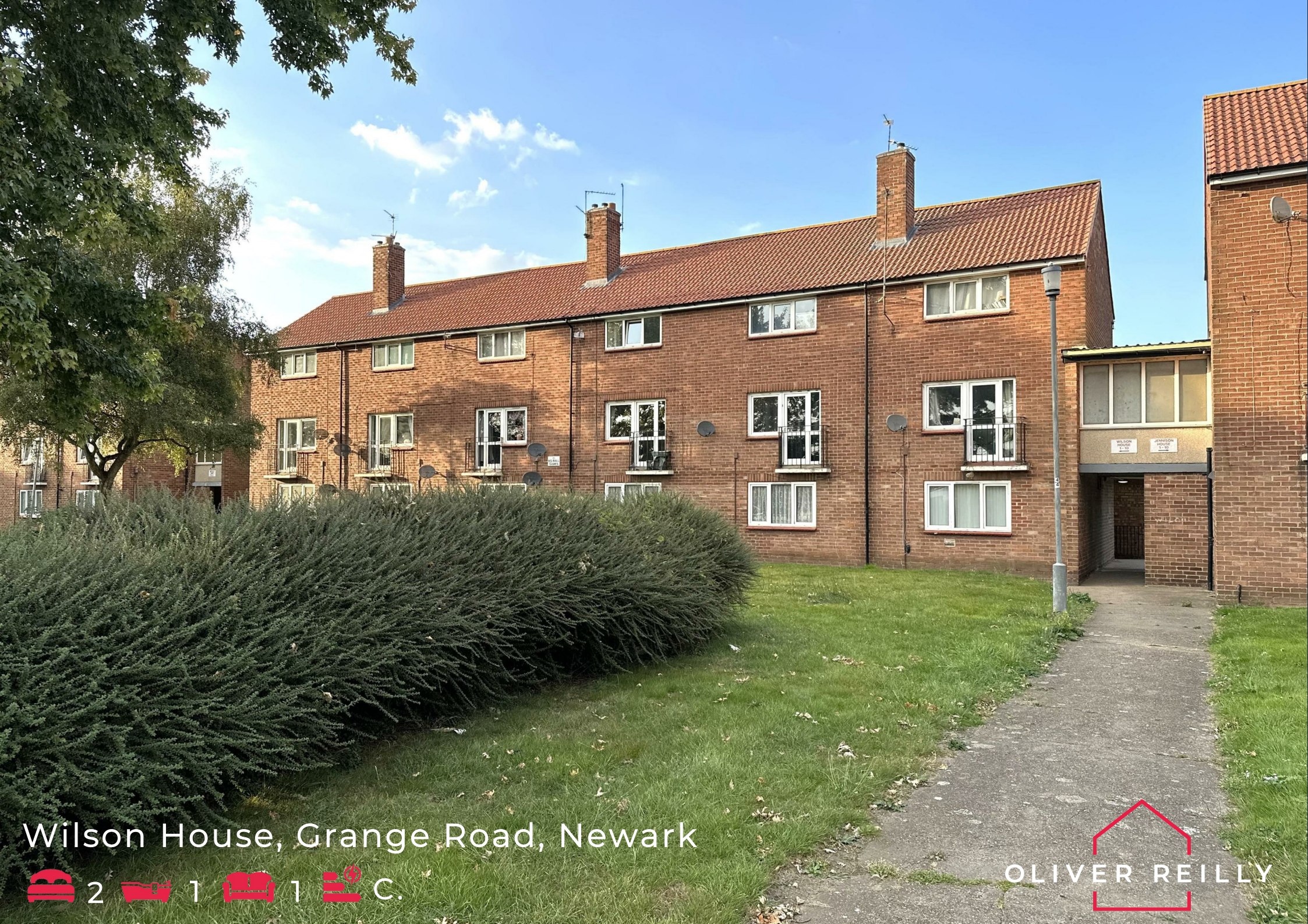
Wilson House, Grange Road, Newark