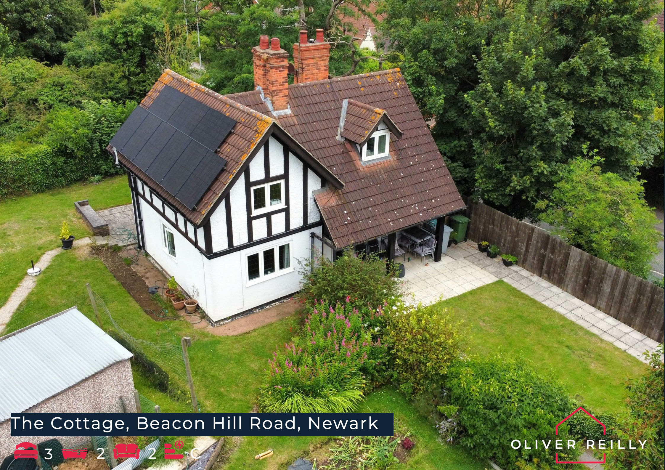
The Cottage, Beacon Hill Road, Newark