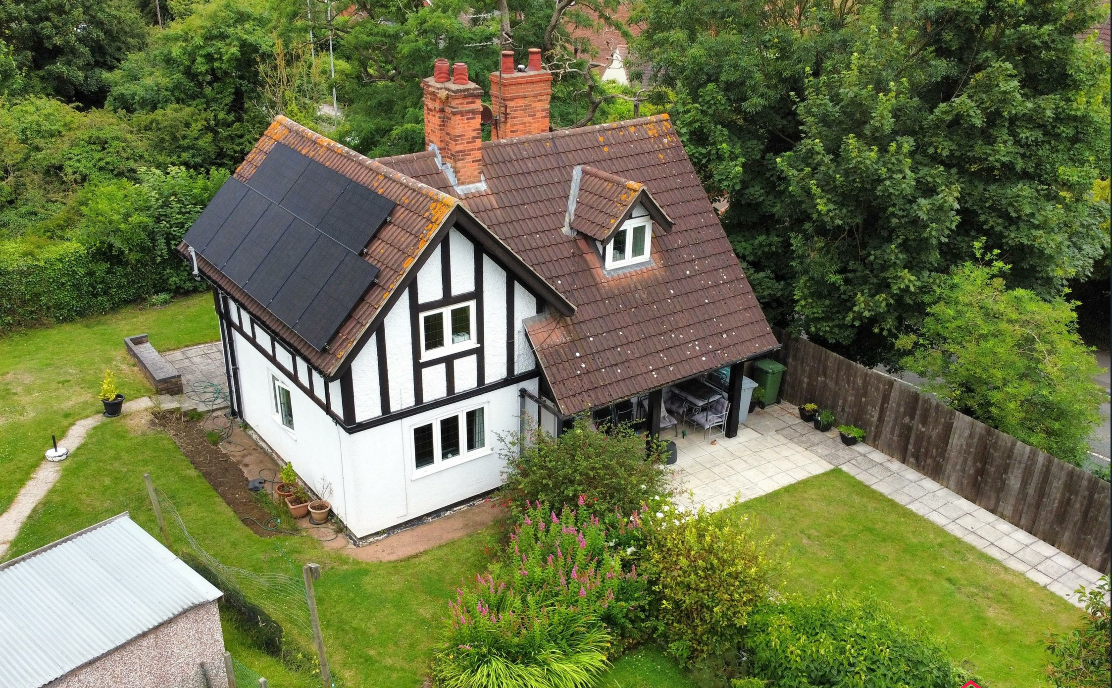
The Cottage, Beacon Hill Road, Newark