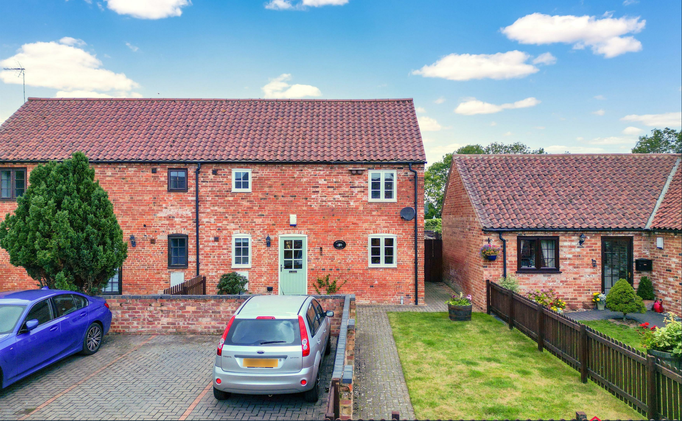
Bramble Cottage, Trent Lane, South Clifton, Newark