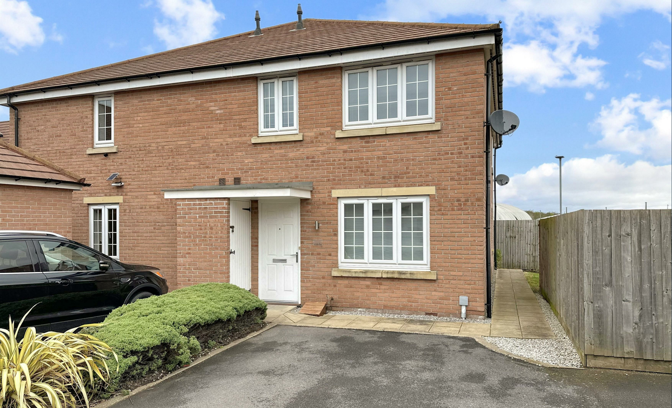
Waters Edge, Kings Sconce Avenue, Newark 2 1 1 C OLIVER REILLY