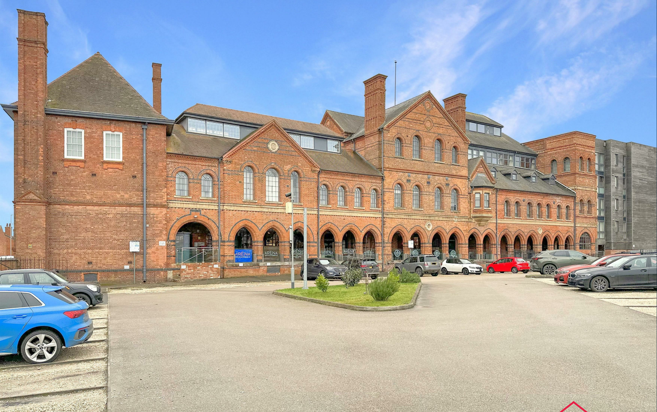
The Tankard Building, Warwick Brewery, Newark